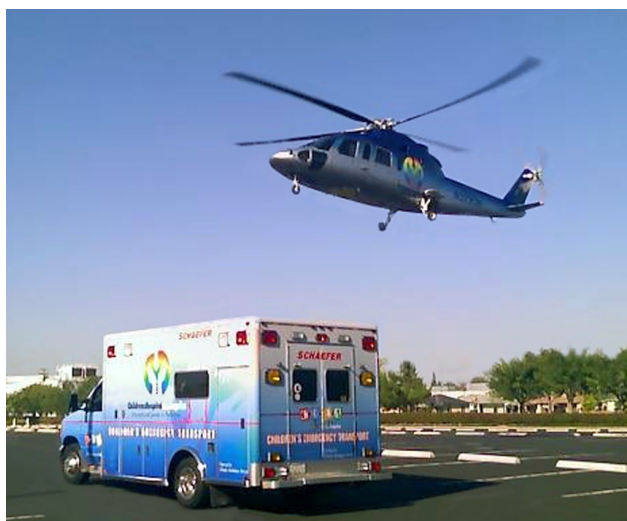
Figure 11. Emergency Department Transport Vehicles

Another interesting study published in Pediatrics in 2006 found that increased 24-hour survival from pediatric in-hospital arrest was associated with the presence of physicians trained in pediatrics. The presence of pediatric residents was associated with the greatest improvement in 24-hour survival. 94 This study reinforces the importance of pediatric-specific resuscitation guidelines. It also suggests that in a teaching-hospital environment, where PALS guidelines are more likely to be reinforced, competency is less likely to deteriorate. A group from Washington State explored video conferencing as a means of providing PALS retraining to physicians in geographically isolated locations. 95 They found no difference in effectiveness between video conferencing and instruction provided in the traditional format. Thus, video conferencing may be a viable alternative for providers in remote locations. Nevertheless, both groups showed a decline in knowledge and skill at 1 year. This does not necessarily suggest that the AHA