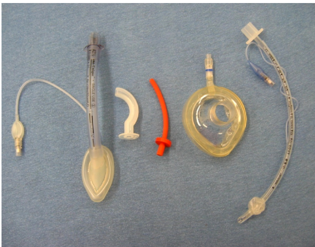
(Left to right): laryngeal mask airway, oral airway, nasal trumpet, mask (without bag attached), and cuffed endotracheal tube.

The most common causes of cardiac arrest, as noted in a 2002 Pediatrics article, were respiratory failure and circulatory shock. 5 A 2004 study by Young et al prospectively studied 601 out-of-hospital cardiac arrest events. 27 The 3 most common causes were sudden infant death syndrome (SIDS) (23%), trauma (20%), and respiratory compromise (16%). Other researchers report that the most common presenting rhythms in pediatric cardiac arrest were asystole (78%), pulseless electrical activity (PEA) (12.5%), bradycardia (1%), 34 and VF/ pulseless ventricular tachycardia (8% to 18%). 28 The most common causes of prehospital combined cardiopulmonary