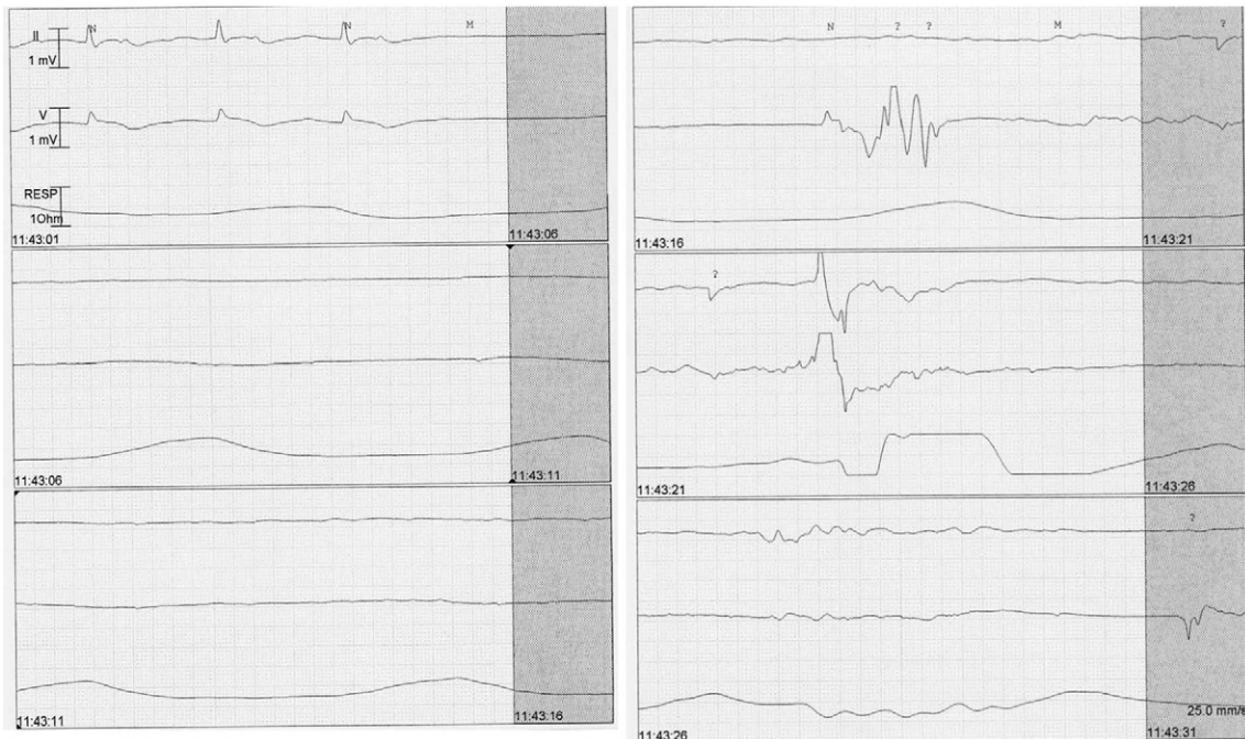
Fig. 2. Pulseless electrical activity degenerating into asystole.

In witnessed out-of-hospital arrest, PEA is an almost always fatal occurrence with only 4% of patients leaving the hospital alive [1]. It constitutes 20% of victims of cardiac arrest [1]. There is a paucity of data on the outcome of thrombolytic therapy in PEA due to confirmed PE. Most studies have reported on thrombolysis in undifferentiated PEA or in PEA due to suspected but not necessarily confirmed PE [2,3,9]. This article is therefore one of the few which reports on PEA due to massive PE with 100% confirmation. Favorable results have been noted with thrombolysis in patients with a high suspicion for PE [10–14]. The American Heart Association gives a grade IIa for administration of thrombolytic therapy during cardiac arrest due to PE [7]. In 1995, Jerjes-Sanchez et al [10] randomized 8 patients with massive PE and shock (but no PEA) to IV streptokinase plus heparin vs heparin alone. All 4 patients in the streptokinase group survived, whereas all 4 patients in the control group died ( P = .02 ) [10]. In a retrospective review of 21 patients with massive PE and shock or cardiac arrest, tPA was administered at 0.6 mg/kg (maximum dose, 50 mg) over 15 minutes, followed by heparin