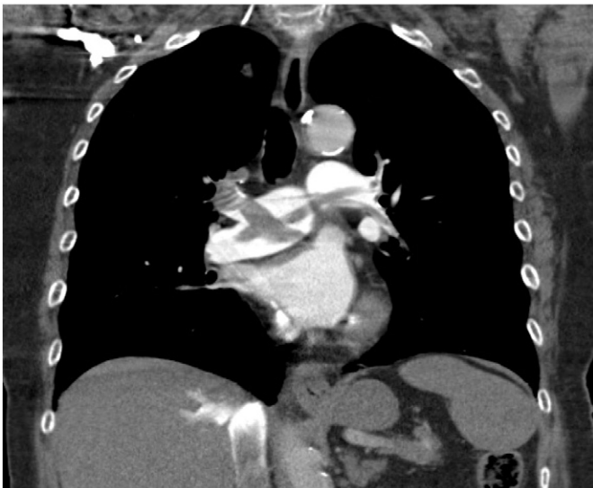
Fig. 1. A representative example of a CT pulmonary angiogram demonstrating extensive bilateral and saddle PE in the coronal plane.